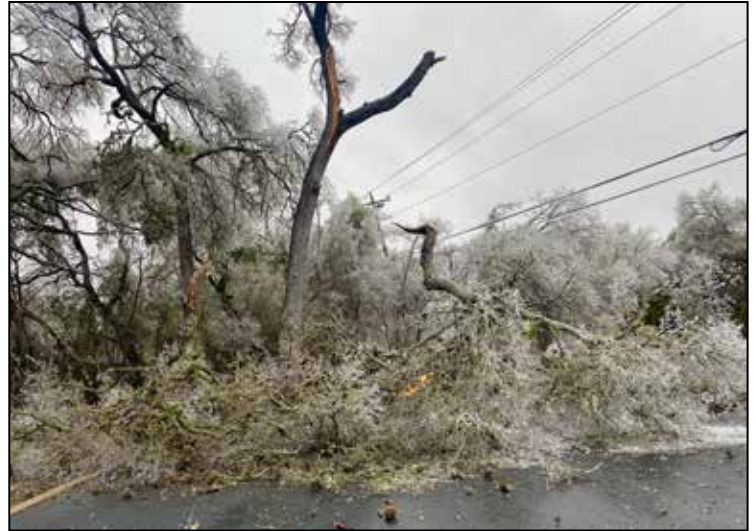
Granada Hills Park after the ice storm.

Throughout Granada Hills, not unlike the rest of the city, we are working to clean up storm debris, downed trees and branches, and repair damages to homes. The hum of chainsaws now fills the air and has become a new normal for the time being. As with so many disasters, the silver lining lies in the kindness and generosity that overflows in times of need. Neighbors are outside, spending long hours talking with and helping one another. We are knocking on the doors of our neighbors, bringing them food, sharing