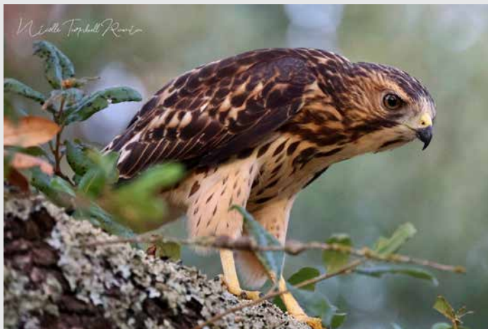
A broad winged hawk on La Fauna Circle