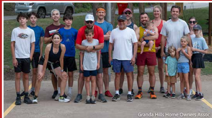
Granada Hills Home Owners Assoc

This is a big event that requires a great deal of work and planning, but it is so worth it. If you have ideas for the 2024 celebration, please reach out to the HOA!