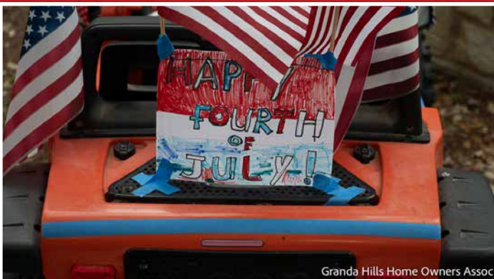
Granada Hills Home Owners Assoc

A family-friendly 5K fun run through Granada Hills; One of a kind decorations in the parade.